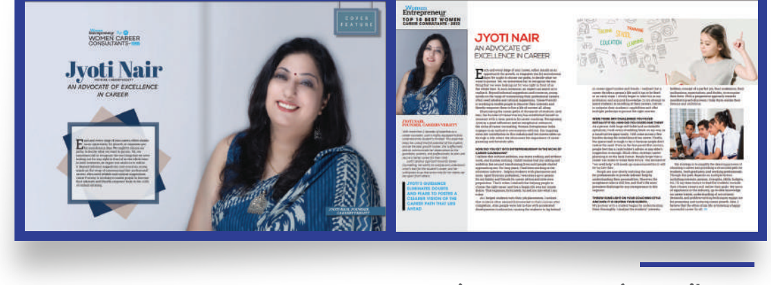
Women Entrepreneur (Cover Feature) - April 2022